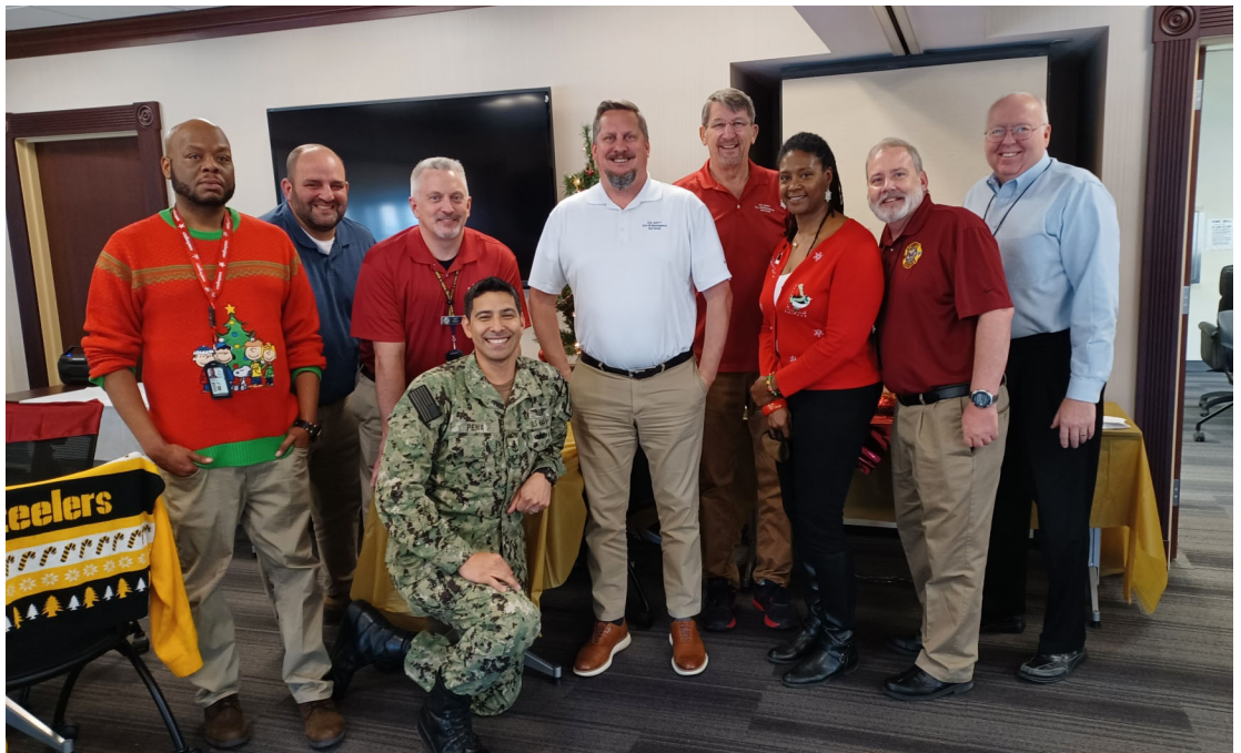
CNIC N30— 2021 Christmas Party