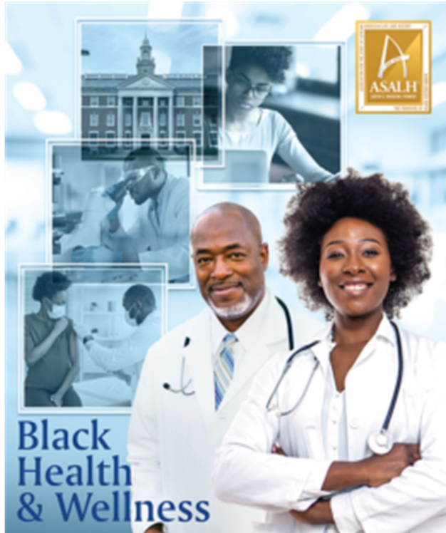
Association for the Study of African American Life and History (ASALH) image

Each February, the Department of the Navy (DON) celebrates African American / Black History Month and