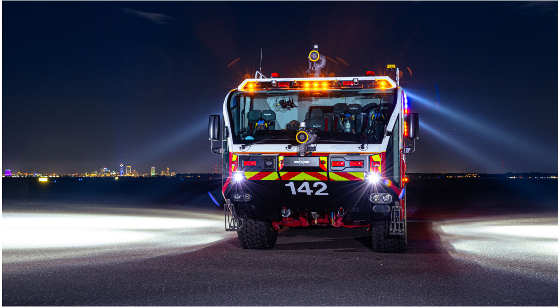
NAS Jacksonville; Oshkosh ARFF Night Operations