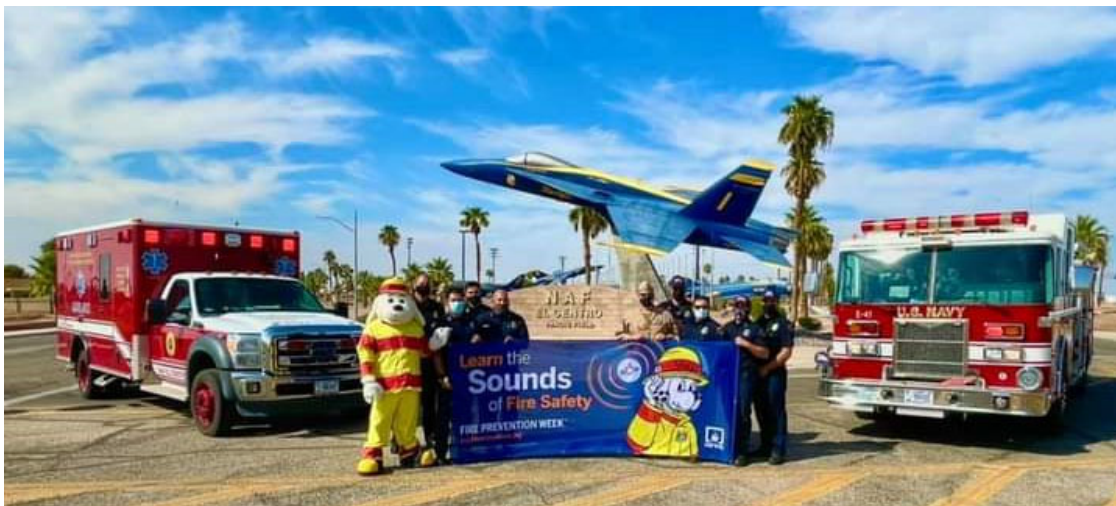
NAF El Centro Fire Prevention Week 2021, Kickoff Pic