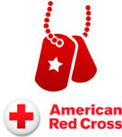
Hero Care Network