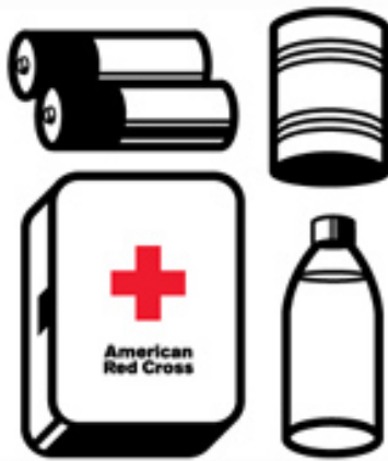
Get a Kit