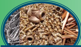
100% Metal Items

Metal with less than 30% foreign attachments. Electronic items, metal furniture, cooking utensils, etc.