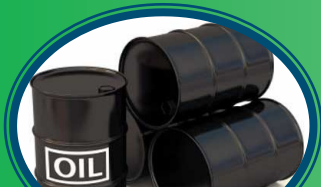
Used Fuel Oil

Good condition crates and pallets. Excludes excessively soiled/dry-rotted items, painted or finished items, etc.