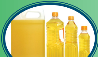
Used Cooking Oil

Oil/lubricants approved for recycling. JP-5, Lube-oil, hydraulic fluid, etc. Residents must contact the Housing Office.