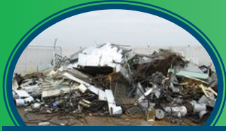
Mixed Metal Items

Metal with less than 30% foreign attachments. Electronic items, metal furniture, cooking utensils, etc.