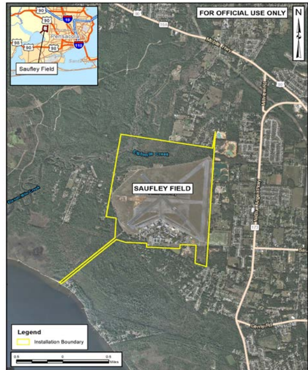
Figure 1- Saufley Field

Perfluorooctanoic acid (PFOA) and perfluorooctane sulfonate (PFOS) have been detected in groundwater at Saufley Field. The Navy is asking for permission to sample drinking water wells in designated areas near Saufley Field because there is the potential for these wells to contain PFOA and PFOS. There is no legal requirement to conduct this drinking water testing. It is a voluntary measure because water quality for our off-base neighbors is a priority for the Navy. The Navy is performing this drinking water sampling in coordination with partners, including Environmental Protection Agency (EPA) Region 4, Agency for Toxic Substances and Disease Registry (ATSDR) Region 4, Florida Department of Environmental Protection (FDEP), Florida Department of Health (FDOH) and the